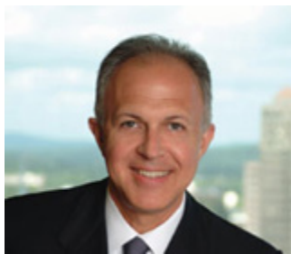
Carl A. Anderson Supreme Knight

Giving generously of time to help others will set the stage for a hopeful future.